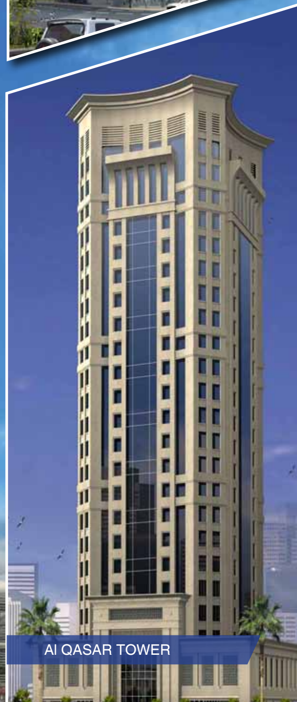
AI QASAR TOWER